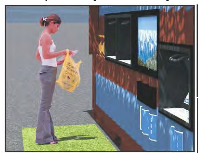
Green Education Foundation's Informational Touchscreen Display

Thank You Coupons Recycling Information Tax- Deductible Receipts Supporting Local Schools Free Nationwide Book Swap